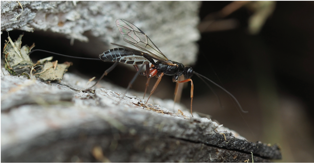
Figure 1. Xorides ater female. Freshly eclosed female resting on a Picea abies woodpile in the Swiss Canton of Bern.