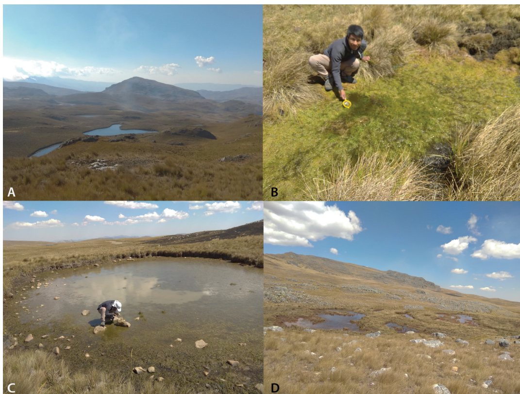
Figure 6. Habitats and landscapes at localities Cajamarca, Cajamarca, Encañada District, Conga, 4030 m [PER_YSM_2018_046] (A, B) and Cajamarca, San Pablo, Tumbaden District, Alto Peru, 3935 m [PER_YSM_2018_51] (C, D).