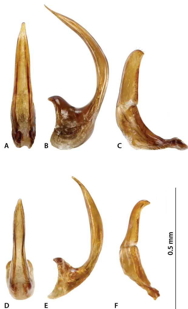
Figure 3. Liodessus spp. males: Liodessus caxamarca sp. nov., holotype, median lobe of aedeagus in ventral view (A), same in lateral view (B), right paramere external surface view (C); Liodessus altoperuensis sp. nov. holotype, median lobe of aedeagus in ventral view (D), same in lateral view (E), right paramere external surface view (F).

Structures. Antenna stout. Head with faint cervical line that dissolves into serial punctures laterally; with rounded clypeus. Pronotum with distinct lateral bead; with distinct and deep basal striae (as in Fig. 1D). Elytron without obvious basal striae on left side and very short