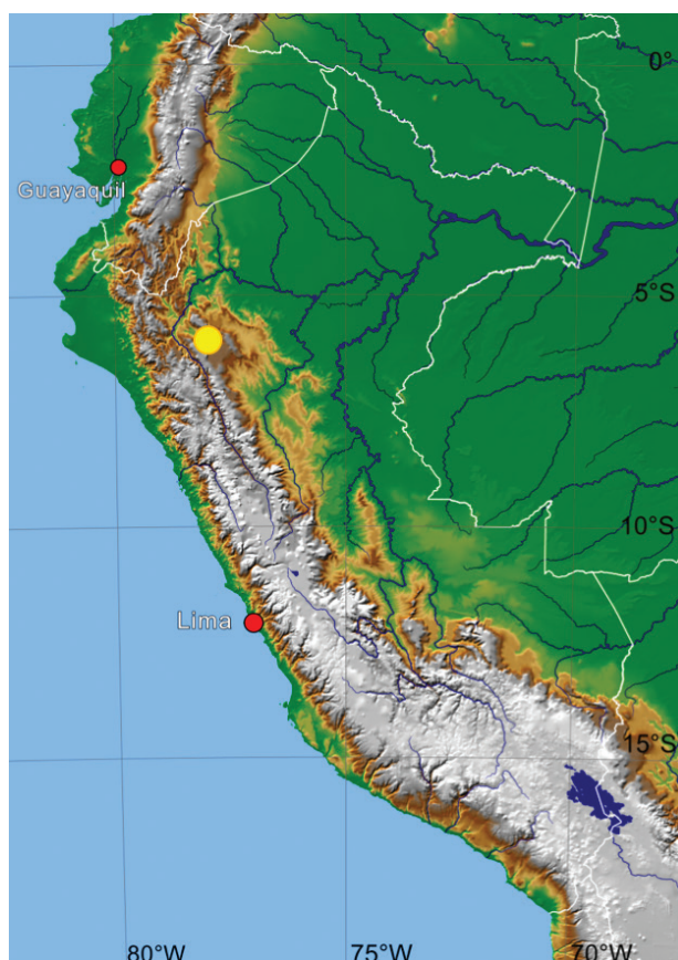
Figure 4. Distribution area (orange dot) of Liodessus caxamarca sp. nov. and Liodessus altoperuensis sp. nov. in the northern Andes of Peru.

Female. Dorsal surface dull due to presence of well impressed microreticulation between surface punctation (Figs 1A–C, 2A).