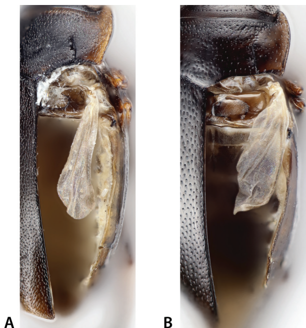
Figure 2. Liodessus spp., female paratypes: Metathoracic wing of paratypes of Liodessus caxamarca sp. nov. (A); Liodessus altoperuensis sp. nov. (B).

254 Paratypes (MUSM, ZSM). 100 exs.: same data as holotype; 30 exs.: Peru: Cajamarca, Cajamarca, Encañada District, Conga, 4013 m, 7.ix.2018, -6.95, -78.354, Y. S. Megna & N. Zenteno (PER_YSM_2018_45); 55 exs.: Peru: Cajamarca, San Pablo, Tumbaden District, Alto Peru, 3928 m, 8.ix.2018, -6.887, -78.595, Y. S. Megna & N. Zenteno (PER_YSM_2018_47); 23 exs.: Peru: Cajamarca, San Pablo, Tumbaden District, Alto Peru, 3947 m, 8.ix.2018, -6.892, -78.599, Y. S. Megna & N. Zenteno (PER_YSM_2018_48); 23 exs.: Peru: Cajamarca, San Pablo, Tumbaden District, Alto Peru, 3961 m, 8.ix.2018, -6.894, -78.6, Y. S. Megna & N. Zenteno (PER_YSM_2018_49); 41 exs.: Peru: Cajamarca, San Pablo, Tumbaden District, Alto Peru, 3933 m, 8.ix.2018, -6.902, -78.603, Y. S. Megna & N. Zenteno (PER_YSM_2018_50); 12 exs.: Peru: Cajamarca, San Pablo, Tumbaden District, Alto Peru, 3935 m, 8.ix.2018, -6.91, -78.614, Y. S. Megna & N. Zenteno (PER_YSM_2018_51).