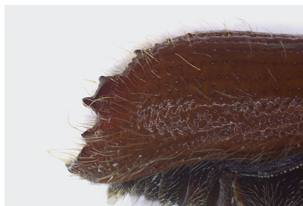
Figure 1. Lateral view of a male Ips duplicatus showing the characteristic spines 2 and 3 on its declivity.

The catches were morphologically and genetically identified to the species level. Morphological identification was done using the key of Pfeffer (1995). Comprehensive and well-illustrated compilations of the key characteristics for discriminating the closely related Ips species, i.e. I. typographus , I. amitinus , and I. duplicatus , can be found in Steyrer (2019) and Bussler (2020). The most typical feature is the ridge between spines 2 and 3 (Fig. 1). The sexes