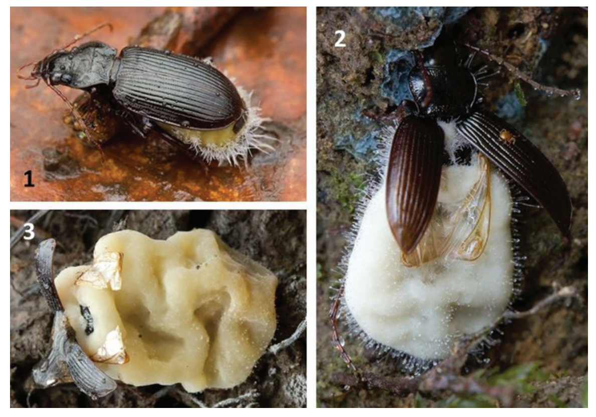
Figures 1–3. 1. Nebria brevicollis at an early stage of fungus sporulation. At this stage the beetle is still able to move it's legs and antennae (nat. length of the beetle about 13 mm). 2. Beetle with fully sporulating fungus showing the extremely swollen abdomen. The strong cystidia are clearly visible at the edge of the fungus mass. 3. At the end of the sporulating period the mycelium turns yellowish (Photos: T. Hülsewig).

The slide with type material contained some resting spores but no other fungal material. The resting spores were spherical, smooth-walled and measured 33.6 (29-41) \mu m (n=35) .