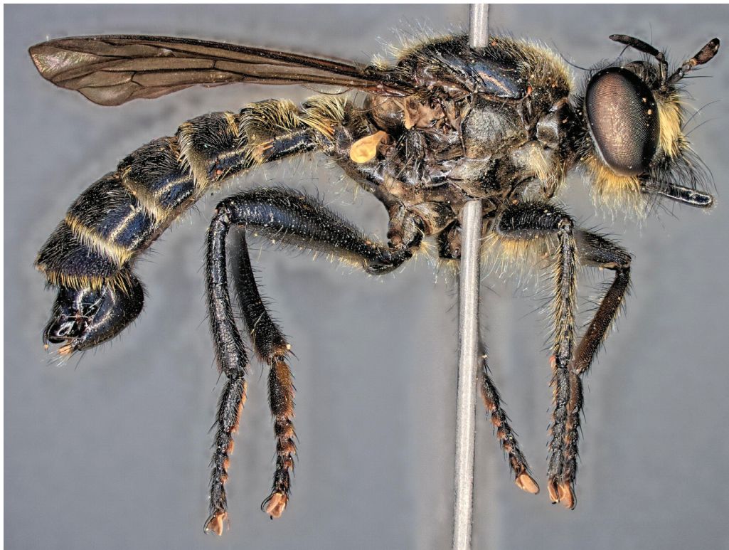
Figure 11. Choerades marginata male, habitus in lateral view (Switzerland).