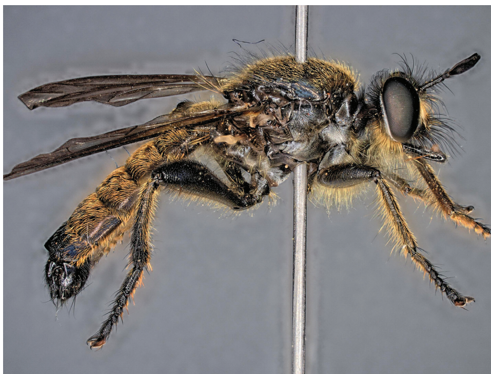
Figure 12. Choerades femorata male, habitus in lateral view (Switzerland).

Ch. mouchai is associated with conifers ( Pinus ) or deciduous trees ( Quercus/Fagus ). Nevertheless, it seems to develop in thermophilic forest situations where both coniferous and deciduous trees are present, within old forests.