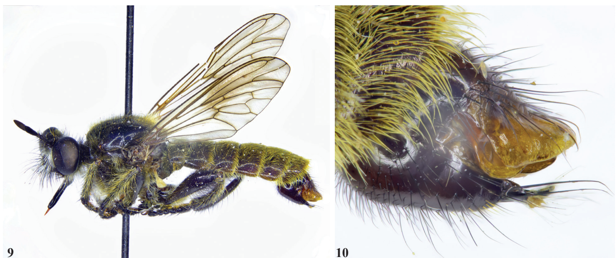
Figures 9, 10. Choerades mouchai , male paratype from Carpathian mountains. 9. Habitus, lateral view; 10. Hypopygium, lateral view.