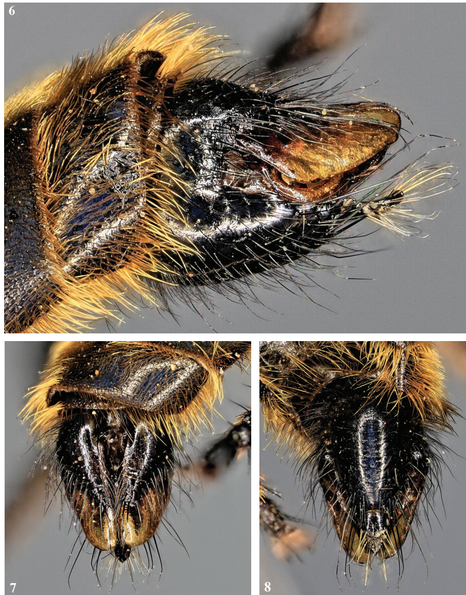
Figures 6–8. Terminalia of Choerades mouchai male found in Bois de Finges (Switzerland) on 17 th of May 2020. 6. Hypopygium, lateral view; 7. Hypopygium, dorsal view; 8. Hypopygium, ventral view.