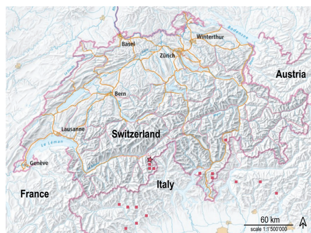
Figure 4. Present distribution of I. orobica in Switzerland and Italy. Only one location is in the drainage area of the river Rhone (red star), all other locations (red squares) are in the drainage basin of the river Po. The Swiss locations represent areas of 5×5 km with a total of 30 sampling stations ( https://infofauna.ch ).

The larvae were found in springs, spring brooklets and in brooks of the epirhithral zone mainly between 900 m and 1500 m, rarely above 2000 m. The substrate varies from organic to coarse stony bottoms in moderate to steep slopes (Fig. 5). The flight periods of the adult insects extend from late June to October at altitudes ranging from 900 m to 2030 m. The accompanying fauna consists of Dictyogenus fontium (Ris, 1896), Chloroperla susemicheli (Zwick, 1967), Siphonoperla italica (Au-