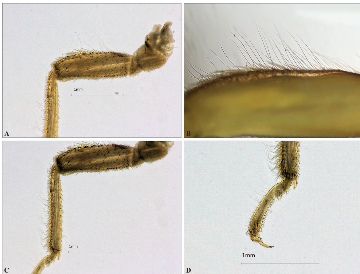
Figure 3. Isoperla orobica , larval morphology. A. Front left femur; B. Front left femur, dorsal margin; C. Front left tibia; D. Front left tarsus (Photos: Pia Teufl, Christoph Novotny).

Cercus pale yellow with a thin brown ring on proximal 1/4 of cercomeres; cercomeres cylindrical; medial cercomeres twice as long as wide. Cercal apical fringes dense, circumferential setae on medial cercomeres approximately one fourth of segment length, dorso-medial and ventromedial setae longer (length: more than half of segment length); cercus without dorsal setal fringe (Fig. 1G, H). Paraproct blunt with widely rounded apex.