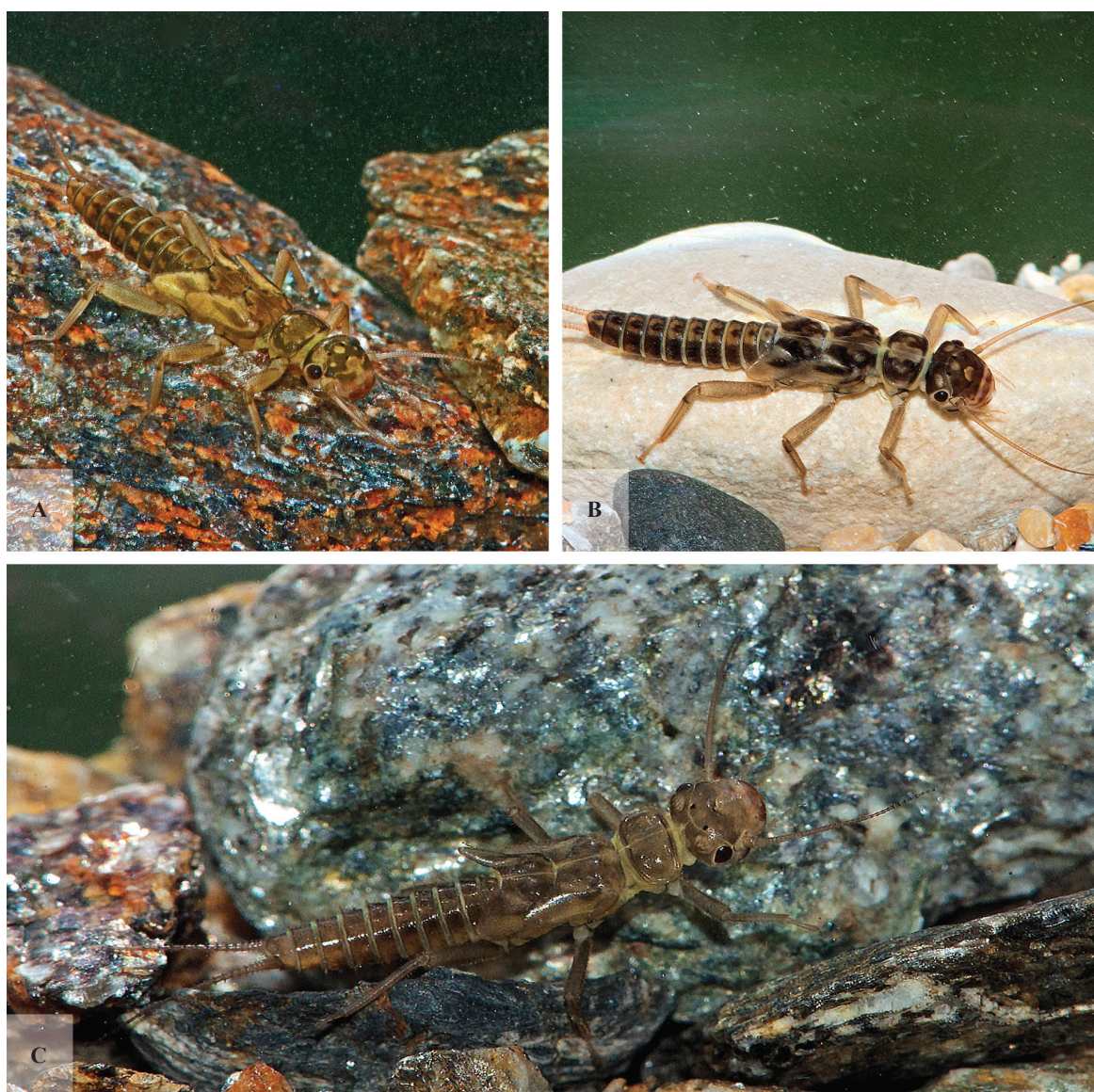
Figure 6. Larval habitus. A. I. carbonaria ; B. I. rivulorum ; C. I. orobica.