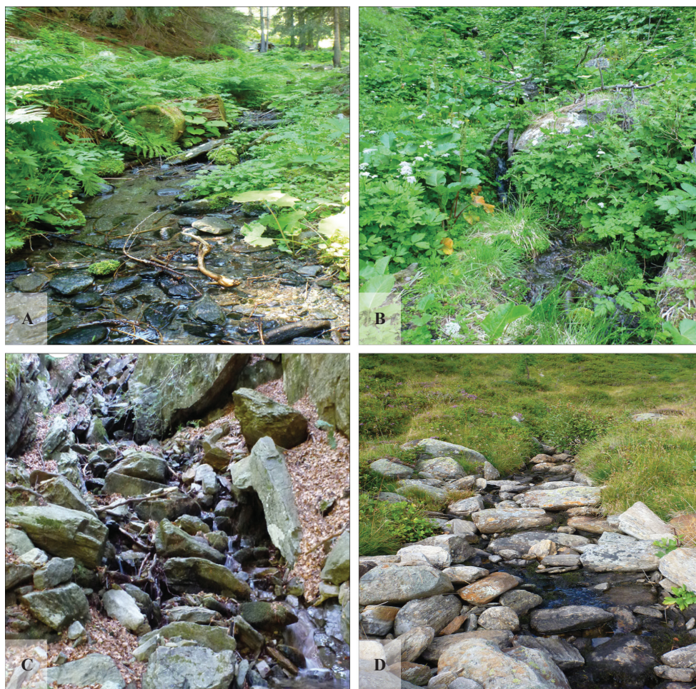
Figure 5. Habitat of I. orobica in Switzerland, upstream views. A, B. Spring brook, tributary to river Taferna (Rhône basin, canton Valais); C. River Vadina, tributary to Lake Maggiore (canton Ticino); D. Brook in Simplon pass, near Stalde (canton Valais).

bert, 1953), Leuctra insubrica (Aubert, 1949), L. armata (Kempny, 1899), L. braueri (Kempny, 1898), L. caprai (Festa, 1939), L. dolasilla (Consiglio, 1955), L. schmidi