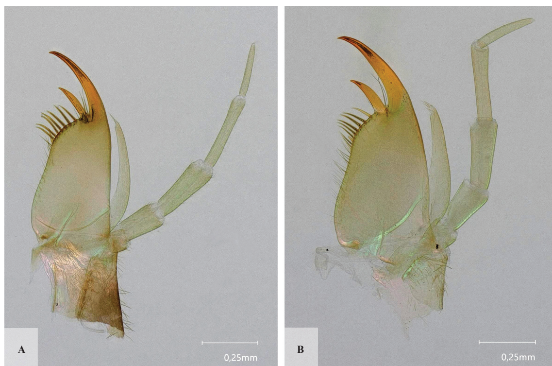
Figure 7. Lacinial morphology. A. I. carbonaria ; B. I. rivulorum.