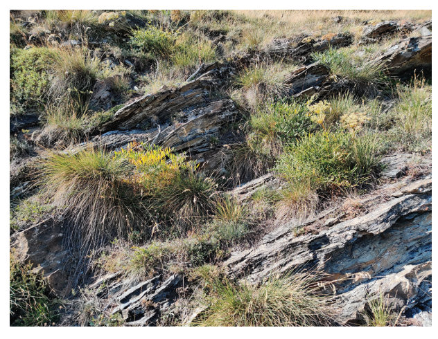
Figure 9. Habitat of Megacraspedus peslieri in the Cottian Alps, above Fenestrelle.

(Huemer et al. 2013), Elophos (Geometridae) (Müller et al. 2019) and Agrotis (Noctuidae) (Ronkay and Huemer 2018) there are different stages of brachyptery, from nearly fully winged to strongly pronounced wing reduction in high altitude taxa. Furthermore, brachyptery can also be restricted to few species within a genus, for example Elachista brachypterella (Elachistidae) (Klimesch 1990). In addition, the females of many fully winged species in mountain regions are generally not very active flyers.