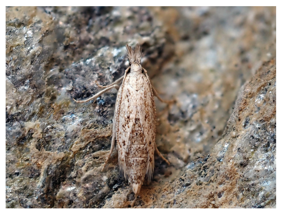
Figure 3. Megacraspedus peslieri, female in natural resting position (Italy, Alpi Cozie).

Female (Figs 3, 5–6). Segment 2 of labial palpus with long scale brush, dark brown on outer and lower surface, cream-white mottled with brown on inner surface, cream-white on upper surface; segment 3 cream-white. Antennal scape without pecten; flagellum cream-white, annulated