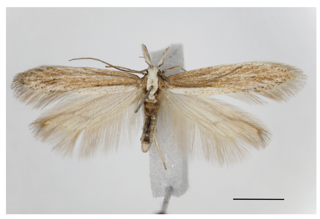
Figure 4. Megacraspedus peslieri, set male specimen (scale bar: 3 mm).