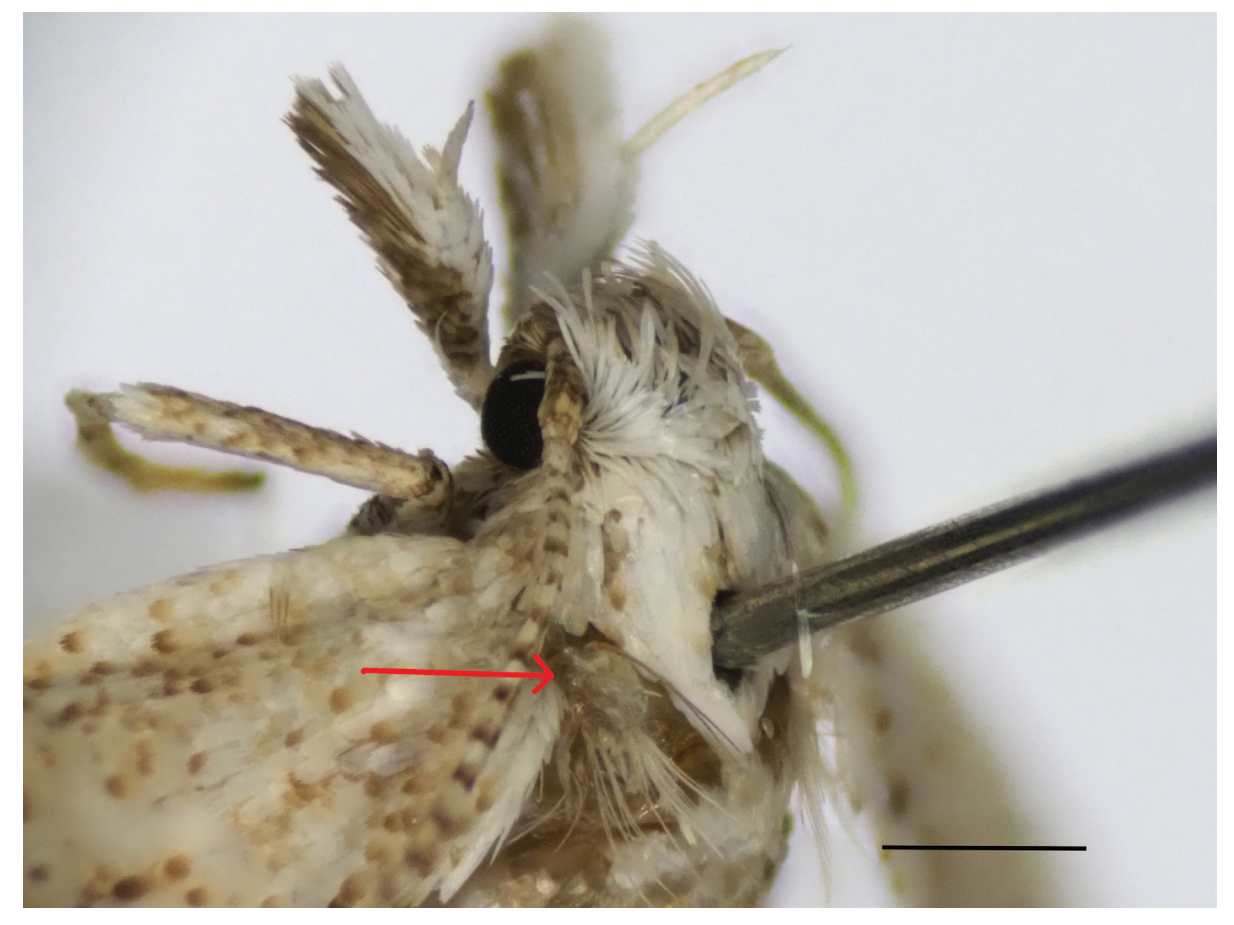
Figure 6. Megacraspedus peslieri, details of female hindwing (marked with red arrow) (scale bar: 0.5 mm).

parts; subgenital plate without specialized sclerotizations, anterior edge with short sinusoid projection delimiting ostium bursae; apophysis anterioris rod-like, about as long as segment VIII; colliculum about 1/2 length of apophysis anterioris, wrinkled, with small sclerotization anteriorly; ductus bursae slender, about 1.5 mm long; corpus bursae clearly delimited, about as long as ductus bursae, slender; signum moderately small, laterally oblong spiny plate, with about two dozen small to strong spines.