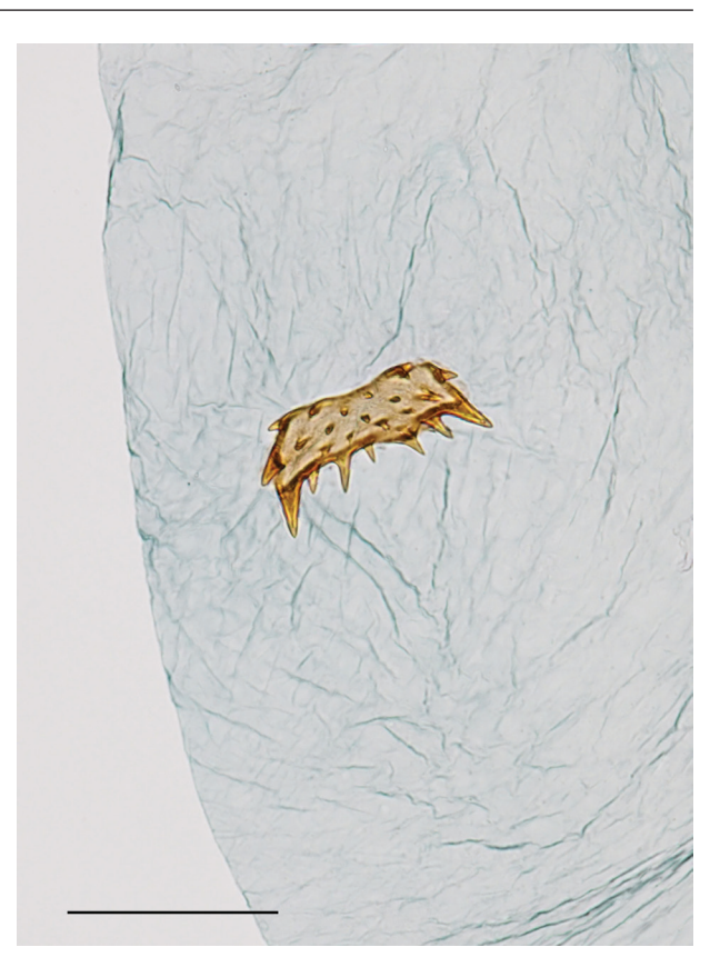
Figure 8. Megacraspedus peslieri , female corpus bursae with signum enlarged. (scale bar: 0.1 mm).