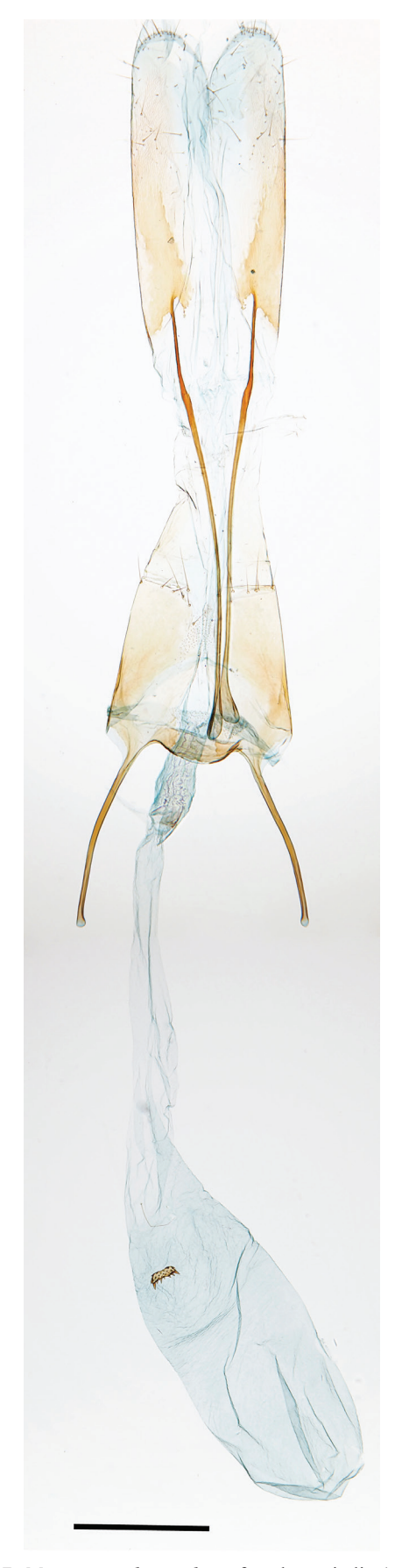
Figure 7. Megacraspedus peslieri , female genitalia (scale bar: 0.5 mm).