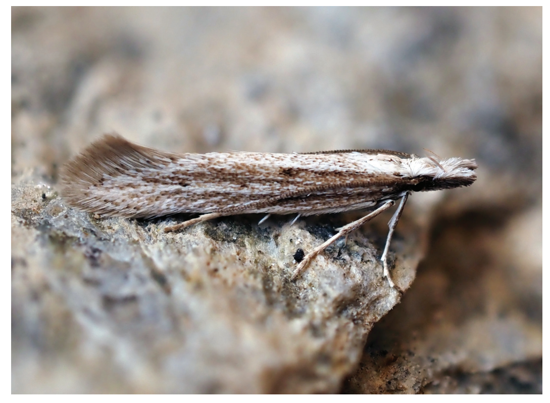
Figure 2. Megacraspedus peslieri, male in natural resting position (Italy, Alpi Cozie).