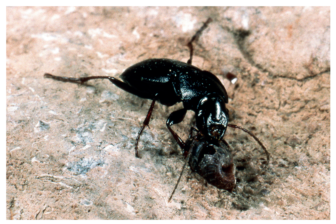
Figure 3. The predatory beetle Licinus depressus interrupts the opening process of the shell and begins to feed on the soft tissue of the prey snail.